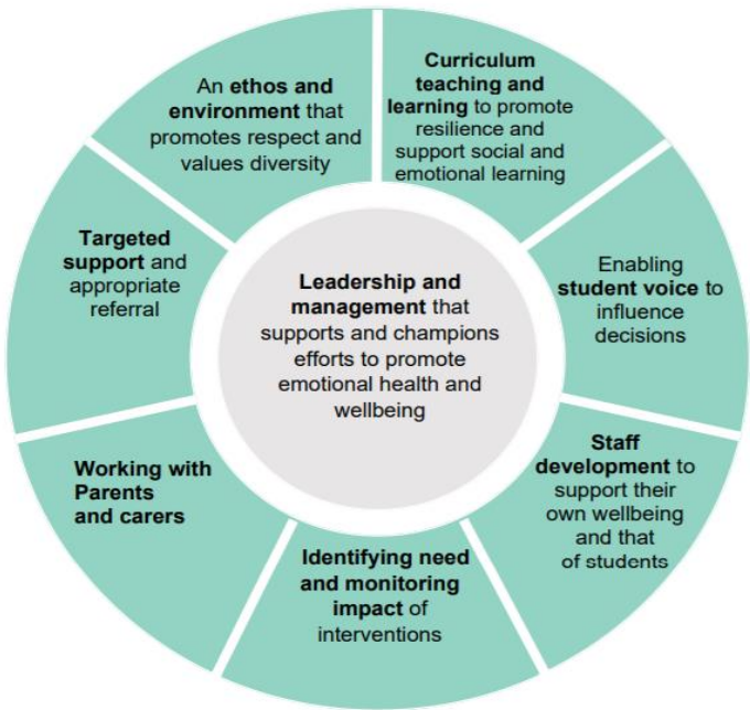
Figure 2. Eight principles to promoting a whole school or college approach to mental health and wellbeing.

COVID and Mental Health: We should not underestimate the adverse effect that COVID-19 has on pupil’s mental health and well-being. This is recognised and understood by Appleford School, where we strive to provide a positive environment for our pupils and our staff. We promote positive mental health and recognise and respond to mental ill health. By developing and implementing practical, relevant and effective mental health policies and procedures, we can promote a safe and stable environment for pupils and staff affected directly, or indirectly, by mental ill health. We pursue this ideal through whole school approaches, and targeted approaches aimed at individually vulnerable pupils.